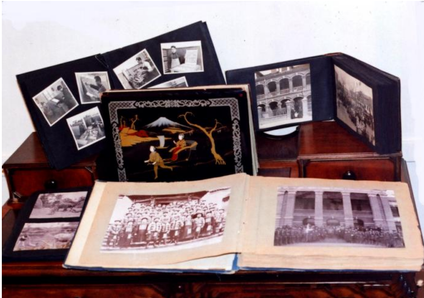
These are my Grandfather's Photo Albums from which I digitized 1,000 photos of China taken in 1910-1915