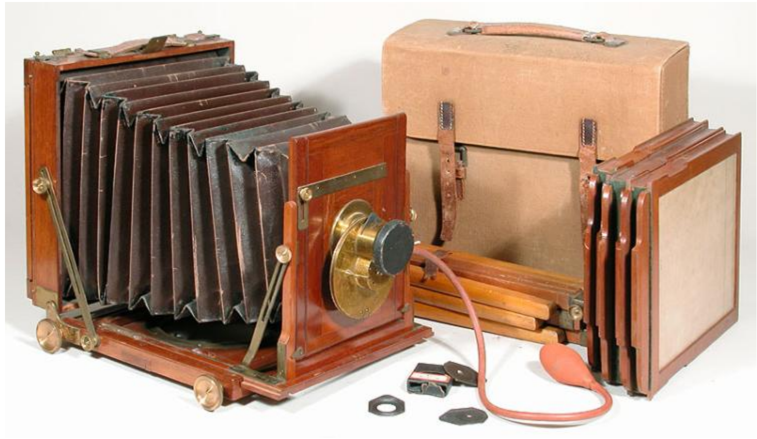
Field camera similar to ones used by Francis Stafford