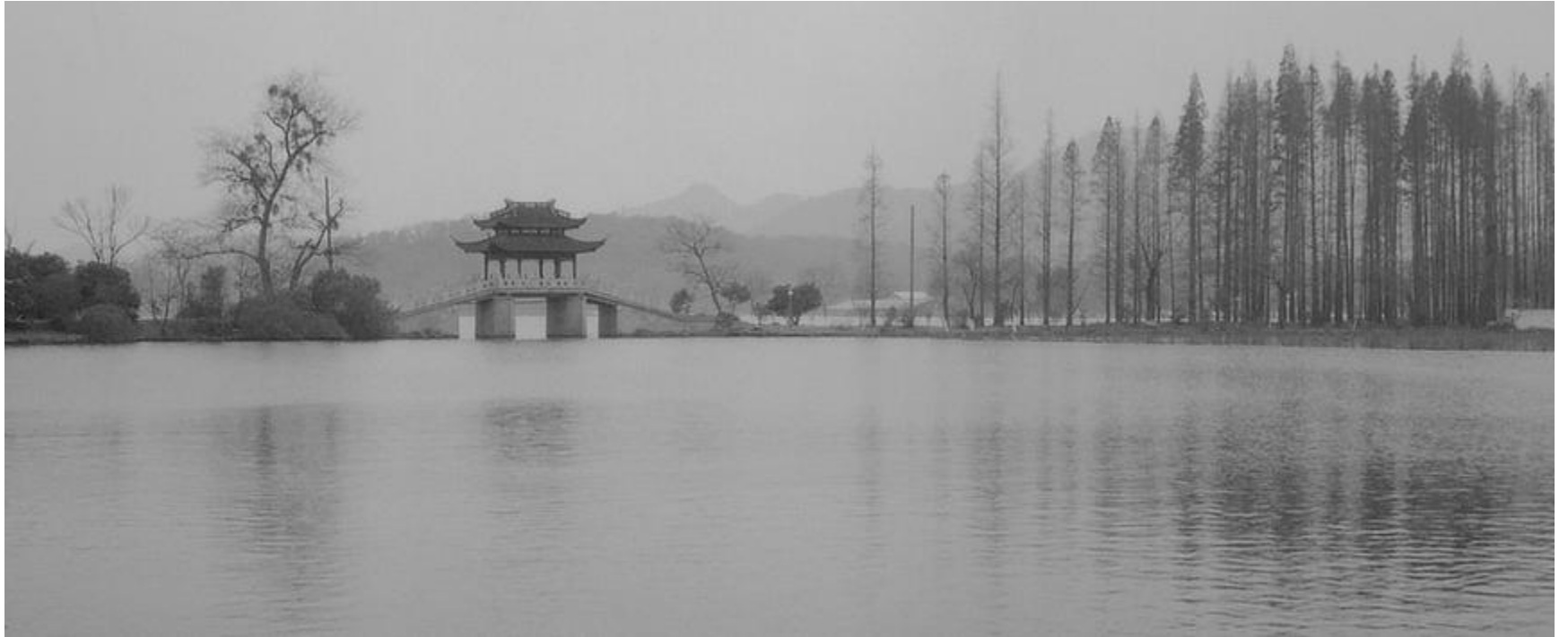
West Lake in Hangzhou, China Relatively unchanged in 100 years