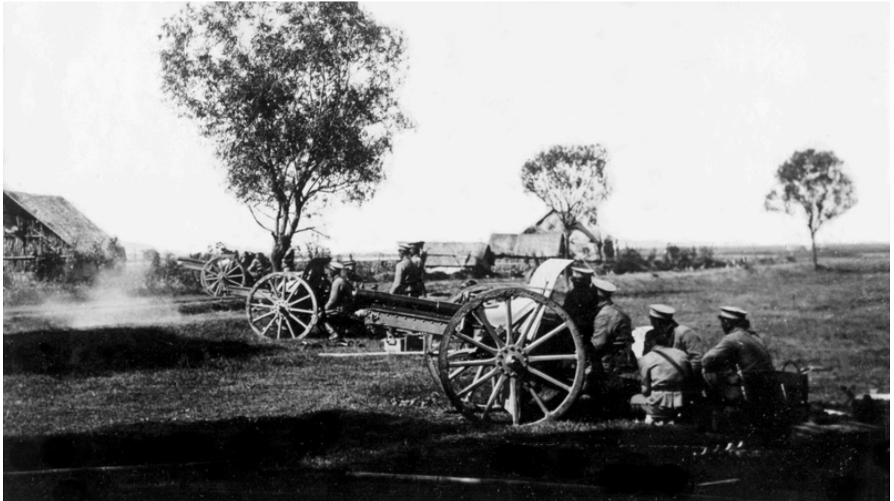
Artillery Troops in Battle in Hankow. These soldiers were part of the Qing Imperial army moved into the Wuhan area to fight the rebels in October-November 1911.