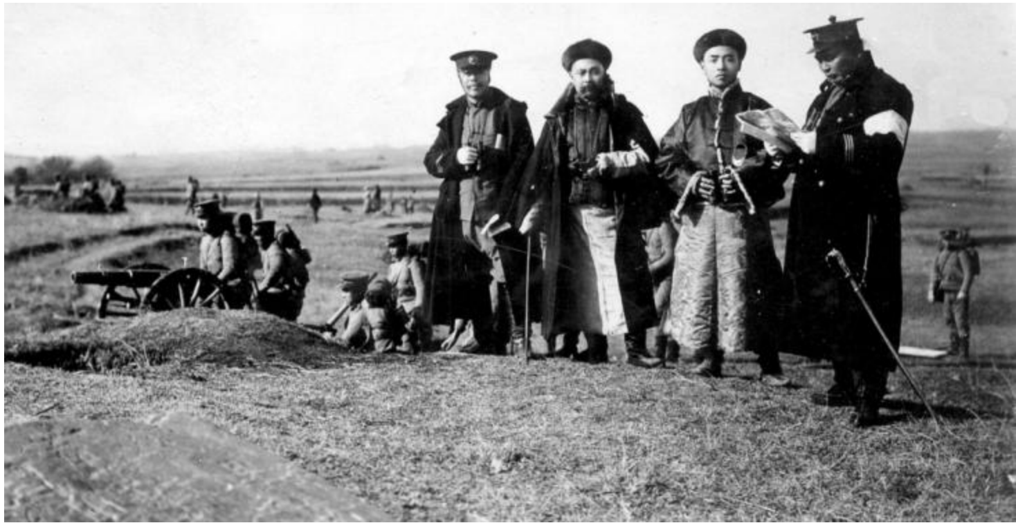
Rebel field commanders in the Wuhan area, the first Major battle of the Nationalist Revolution, 1911